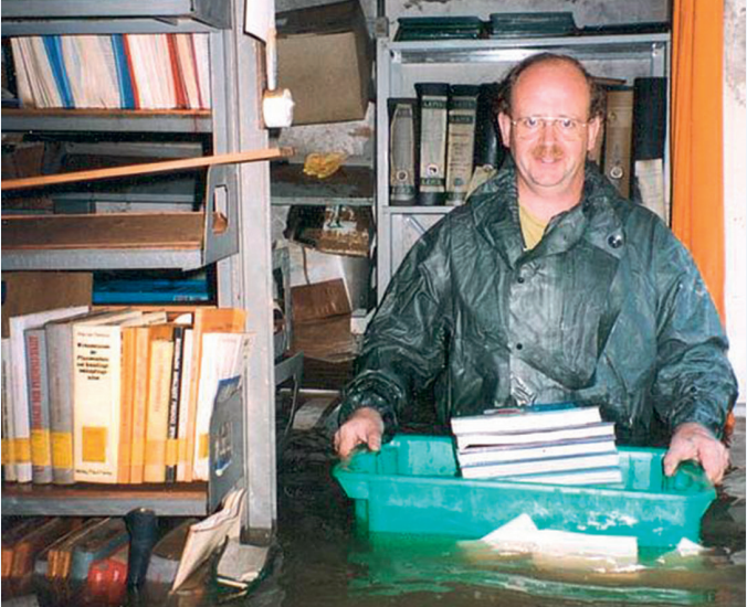
Floating books in the magazine of the Library on Forestry at Tharandt, Germany Title image: Graffiti of the 1954 Hague Convention's emblem on the remains of the Berlin Wall, Berlin

The German National Committee of the Blue Shield is a registered association located in Berlin. Our members belong to varying professional disciplines, but are united in their great motivation to further the protection of cultural property in Germany and world-wide. The association's board reflects this interdisciplinary approach. The board not only consists of individual members, but also of representatives of our six constituting members.