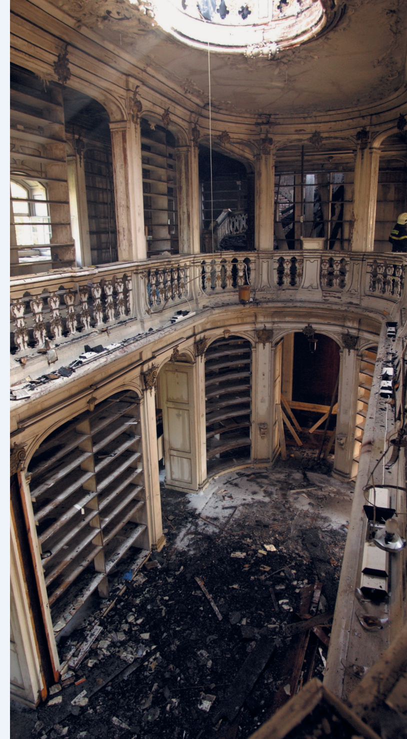
Fire damage in the Herzogin Anna Amalia Bibliothek in Weimar, Germany