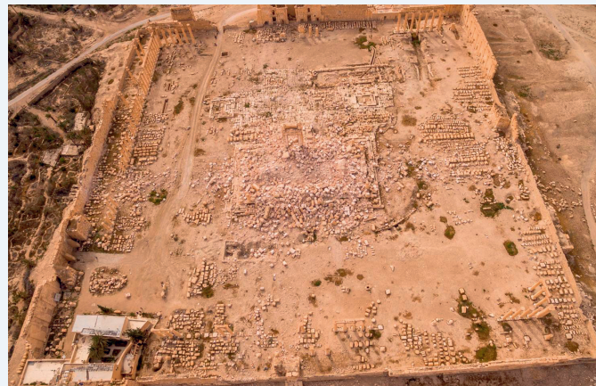
Aerial view of the Baal Temple in Palmyra, Syria, which was destroyed by the IS in 2015

The issue at the heart of Blue Shield International is the implementation of the 1954 Hague Convention on the Protection of Cultural Property in the Event of Armed Conflict as well as its two protocols adopted in 1954 and 1999, respectively.